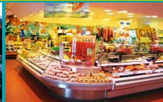
Tegut: German example of chain differentiation