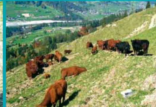
Naturabeef: Swiss example of chain innovation